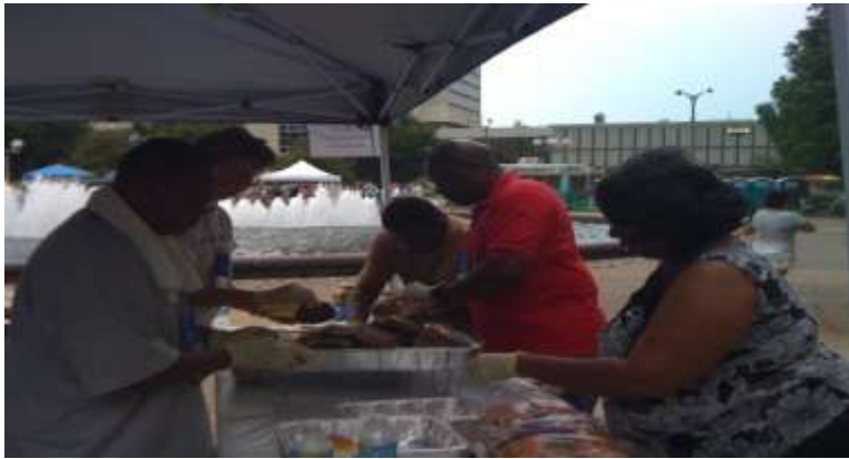
Area II members hard at work preparing for the ALL States Area Hospitality Night.

Looking Back @ St Louis all states hospitality Night.