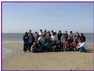
Teen Weekend March 2010

103 Artisan Drive Smyrna Readiness Center Smyrna, DE 19977